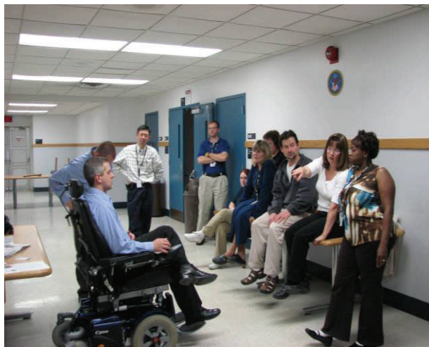
Representatives from wheelchair vendors demonstrated their latest products during the lunch expo on day 2.