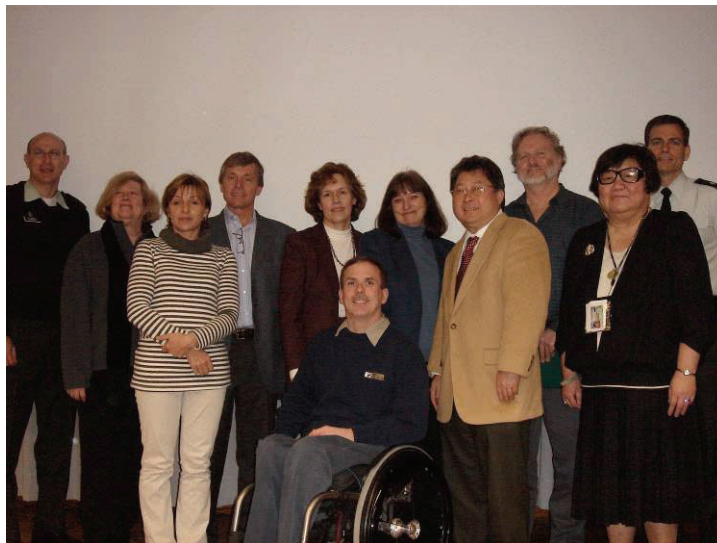
Researchers from the Pittsburgh Tissue Engineering Initiative and the McGowan Institute for Regenerative Medicine joined HERL and WRAMC to host the State of the Science Workshop on Regenerative Medicine