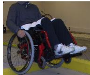
Subject descending the 100mm curb

Relevance to Wheelchair Users: This data is clinically important because it could present a justification to prescribe a suspension manual wheelchair over a non-suspension manual wheelchair to reduce to incidence of low-back pain and other secondary injuries, and therefore reducing hospital costs and personal injury to veterans who use manual wheelchairs.