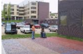
Shock and vibration were measured as subjects propelled manual wheelchairs over these six pavement surfaces

Results: For both the manual and electric powered wheelchair, at 1 m/s, significant differences were found in peak accelerations between the seat and footrest ( p < 0.0001 ) and between the sidewalk sur-