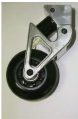
The Oblique Angled Suspension Caster Fork