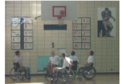
The HERL wheelchair basketball game in September.