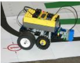
Teams of junior high students working through Techlink will program this LEGO robot to use sensors to perform lifting and grabbing tasks.

As I am writing this, plans are underway at HERL for a Tech-Link Robotics Camp, which will take place on November 16 here at the Highland Drive VA. The camp's goal is to inspire interest in math, science, and technology in junior high students with and without disabilities. HERL engineers will mentor several teams of Tech-Link students in programming and maneuvering a LEGO Mindstorm robot. We hope this robotics camp will lead to future involvement in an officially sanctioned FIRST Lego League Robotics Competition. We will report on the results of the Tech-Link Robotics Camp in the next edition of the HERL Quarterly newsletter, which will be published in March 2003. If you are interested, please visit our website at www.herlpitt.org .