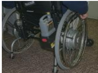
The Yamaha JWII PAPAW

Procedures: Ten manual wheelchair users were examined for upper extremity joint ROM and stroke fre-